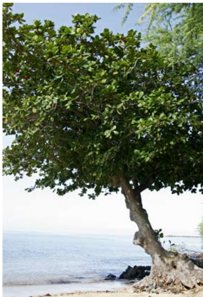
Tropical almond can withstand coastal winds and salt spray.

Tropical almond is adapted to strong, steady coastal winds, as well as rather frequent (every 2–5 years) exposure to