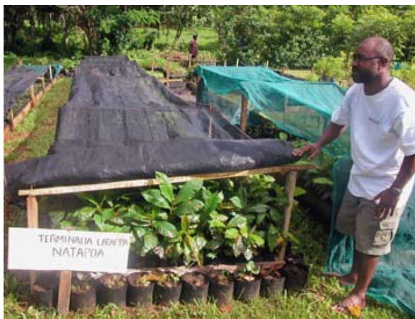
Propagation of seedlings of better nut morphotypes for distribution to farmers, Santo, Vanuatu.

The species has no major drawbacks. The tree is already naturally very widespread in the Asia-Pacific region and has multiple uses, including providing important environmental services such as coastal protection. The nuts are often not utilized or highly regarded as food because of the small size of the kernels and the difficulty of extracting them, but use of selected genetic material can greatly improve the utility of tropical almond nuts as human food.