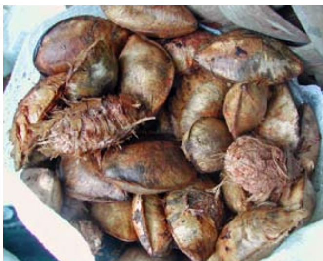
Superior nut morphotypes selected in Solomon Islands and introduced to Tonga in 2002.