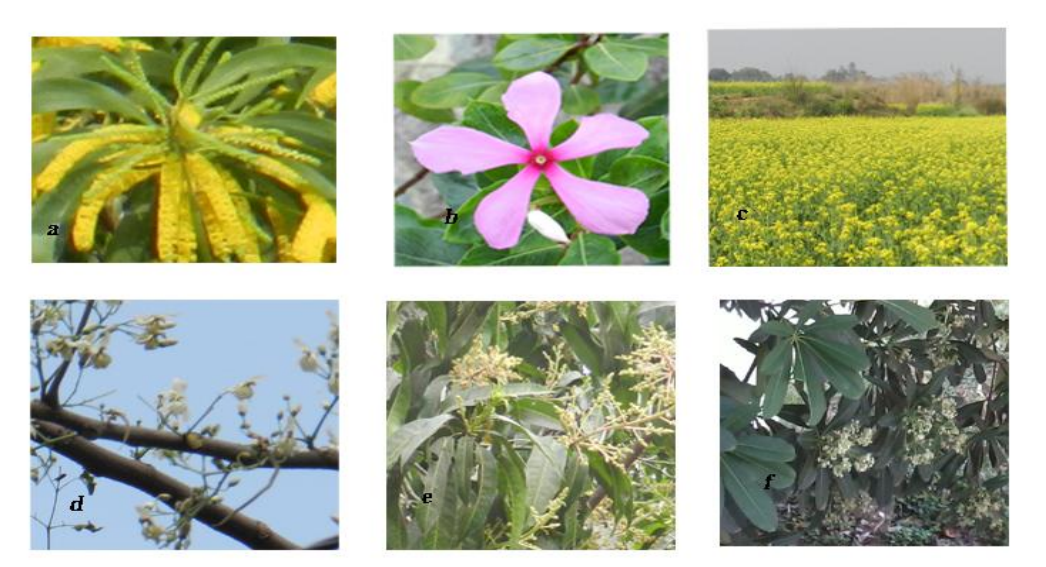
Table 3. Pollen parameters of the investigated taxa by light microscopic study (*E-Exine thickness, O-Exine ornamentation)