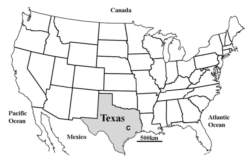
Figure 1. A map of the USA showing Texas (in grey) and College Station (C), where the cotton (Gossypium) flowers were collected and the pollen processed and measured.

beakers were poured back into its original centrifuge tube. Distilled water was added to each sample. The samples were centrifuged, decanted and mixed (Jones et al. 1995; Jones and Greenberg 2009). This process was repeated three times. Samples were acetolysed (Erdtman 1960, 1963; Jones et al. 1995; Hardee et al. 1999; Jones and Coppedge 1999). After 7 min, 5 ml of glacial acetic acid was added to each sample and the samples were again centrifuged, decanted and vortexed. Next, the samples were rinsed three times with water and once with 5 ml of 100% ETOH. A small amount of pollen residue was dropped onto a marked SEM stub. Two drops of Safranin O stain and an additional 5 ml of 100% ETOH were added to the residues. Finally, the samples were transferred into 5 ml vials and three drops of glycerin were added to each sample. The samples were left overnight on a warm hot block (25°C). The next day, the residue was stirred for 15 s. A single drop was placed onto a glass slide, allowed to spread slightly and a cover slip applied. Pollen grains were measured within two weeks after processing. Scanning electron microscope stubs were dried in a desiccator, coated with 450 Å of gold palladium and examined with either a JOEL T6400 or the Quanta 600F FEI scanning electron microscope.