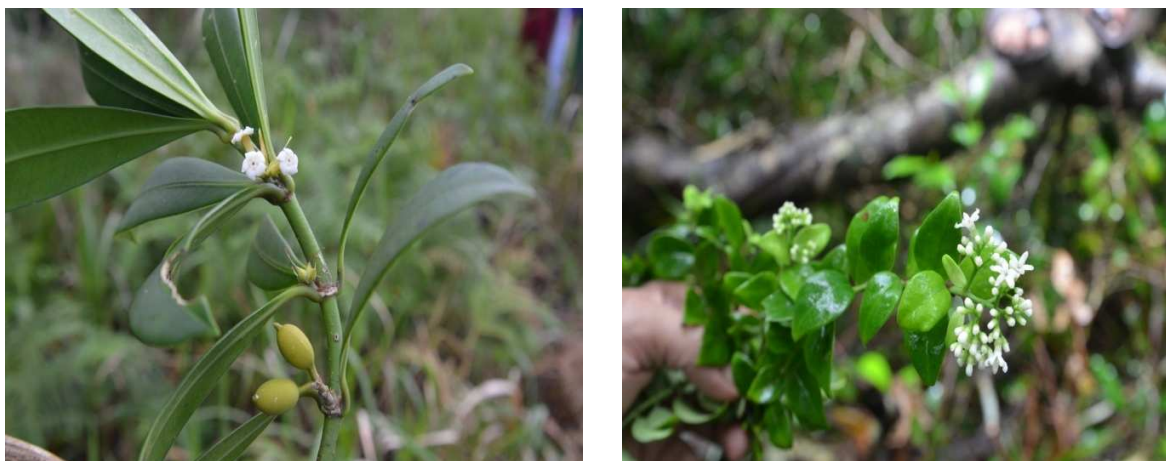
Fig.1: Endemic Rubiaceae Nectarine Food Plants: Hedyotis apoensis Elmer. (Left) and Psychotria luzoniensis F. Vill. (Right)

The predominance of butterflies from the families Danaidae, Nymphalidae and Papilionidae (as the common denominators of all the NFPs listed) at LUBG are due to their great mobility and speed which allows for their high survival rate as they are not easily attacked by predators and their adaptability to both forest and urban vegetations and even pollution 10 . At LUBG, it was observed that the abundance of nutritious host plants for their larva, the high humidity, warm climate and the presence of rotten fruits of Mangifera indica L. and Diospyros philippinensis Rolfe. highly attract these butterflies.